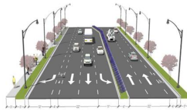
Near I-4 Concept Section