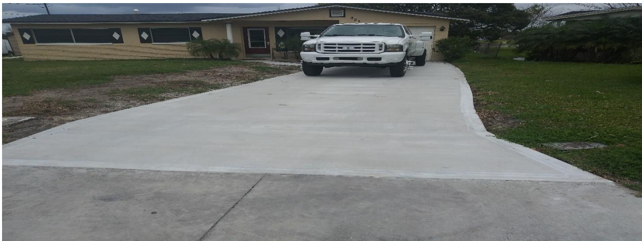
321 Amador Circle Damage Driveway replacement

The Board of Directors have made an annual investment of $30,000 for this program. Up to $3,000 per unit is available to assist income-eligible homeowners that are homestead, who have received notice of code violations, to make the necessary repairs to bring their home into compliance within the CRA District. Assistance is provided as a zero-interest loan requiring no monthly payments if the homeowner occupies the home for five years after the repairs are complete.