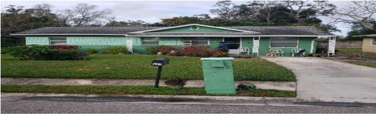
421 Sunnyview Exterior Painting

The Board of Directors have made an annual investment of $30,000 for this program. Through the Curb Appeal Grant, residents within the CRA District can receive assistance to make minor structural and cosmetic improvements to the exterior of their homes. Up to $1,500 is available to assist income-eligible homesteaded homeowners in either a full or matching grant. Residents that don't meet the income requirements can apply for a matching grant of up to $1,500.